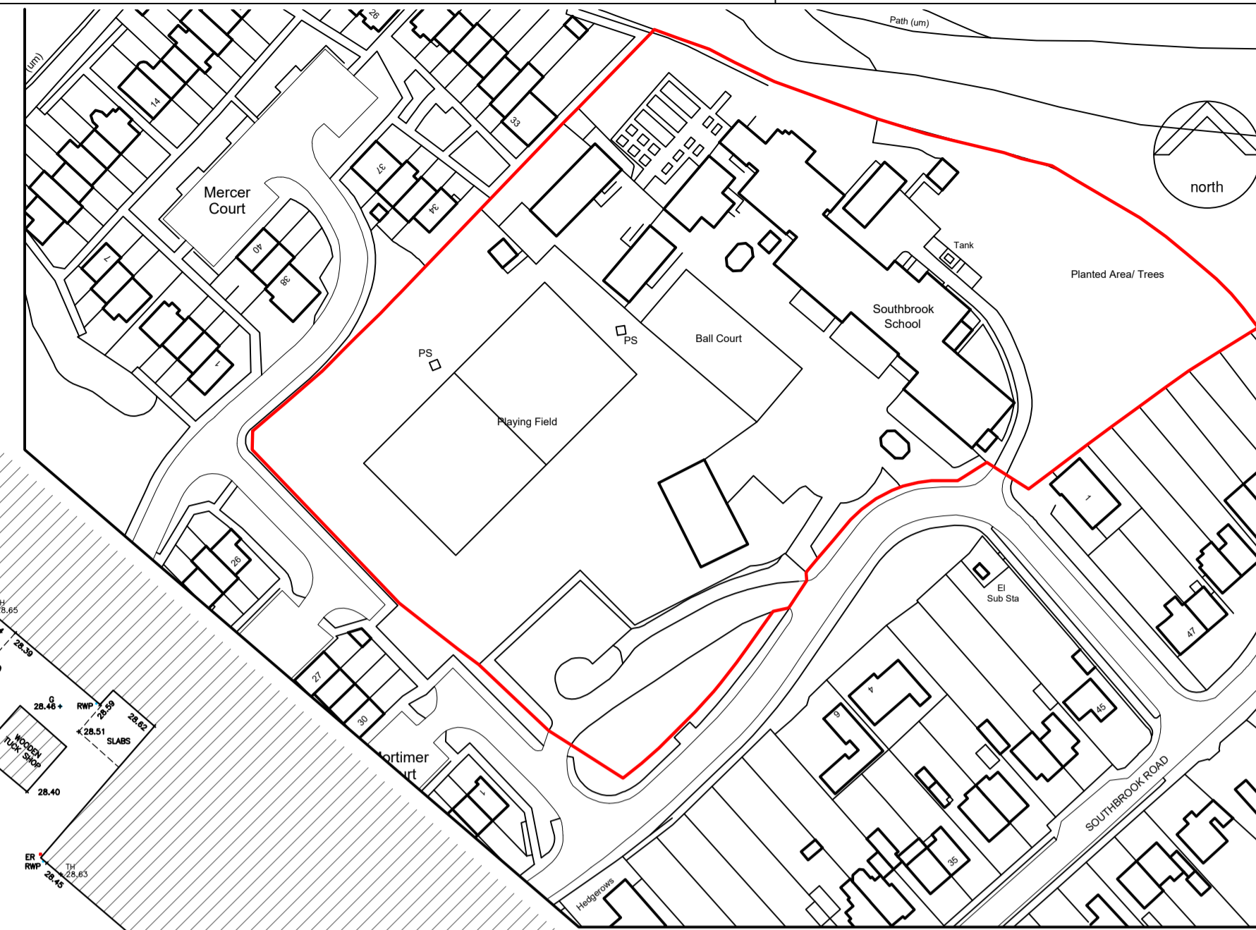
SITE LOCATION PLAN 1:250

RESPONSIBILITY IS NOT ACCEPTED FOR OTHERS SCALING DIRECTLY FROM THIS DRAWING. DO NOT SCALE FROM THIS DRAWING. USE WRITTEN DIMENSIONS ONLY. Scale: 0mm 10 20 30 60mm 1:1 ORIGINAL SHEET SIZE A1